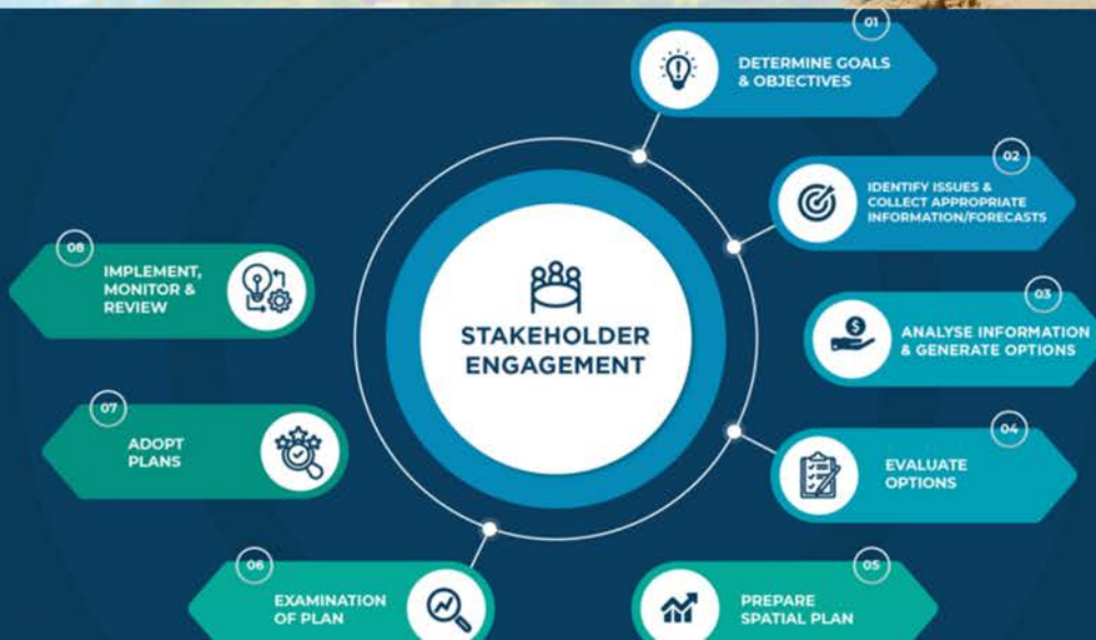
The stages of the MSP process.